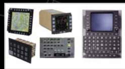
Displays, Integrated Switch Panels