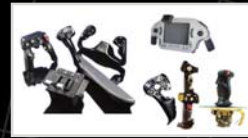
Grips, Control Wheels, Throttle Assemblies