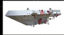
Smart Triple Advanced Rack / Original Triple Ejector Racks