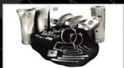
Industrial Gas Turbine Products/ Combustion Parts