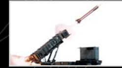
PAC-3 System Components