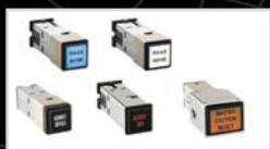
Illuminated Switches & Indicators