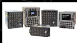
ICS Crew and Flight Stations