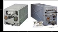
IFF Transponder / Interrogator