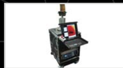
NDE Crack Detection System