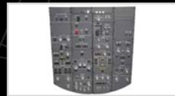
Integrated Control Panel System