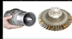
Small Turbofan for Munitions and UAVs