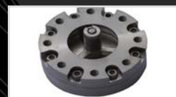
GOX Check Valve for Space Applications