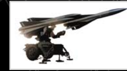
Improved HAWK Components