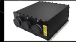
Data Concentrator Unit