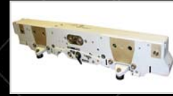
Bomb Rack Units