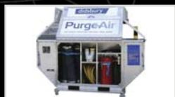
Aircraft Fuel Tank Entry Solution