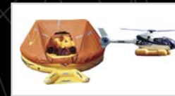
Rescue Life Rafts / Helicopter Floats