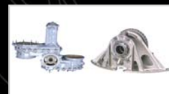
Turbine Engine Components